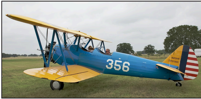
N23VR, Boeing Stearman A75N1, msn 75-0435, ff 1940; ex USAAF 40-1878, N51423.