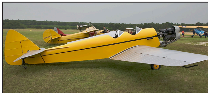
HB-OMU (small plate still on rear fuselage), also registered as N94DH, DH.94 Moth Minor, msn 94020, ff 1937; under renovation.

May the 4th was the annual Pioneer Flight Museum spring fly-in at Kingsbury, TX [85TE]. The weather was not co-operative, but the grounds were in good condition. Only about 10 fly-ins but the museum collection was out, a lot of nice cars, and there was a good book sale that increased my library. The remaining photos are from the event.