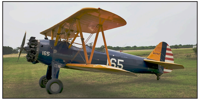
N59767, Boeing Stearman A75N1, msn 75-1165, ff 1942; ex USN 3388.