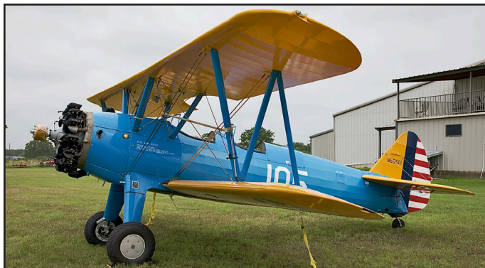
N55501, Boeing Stearman A75N1, msn 75-4740, ff 1943; ex USAAF 42-16577.