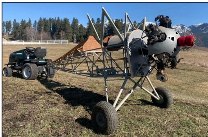
All preceding are Mystery ship.

May the 4th was the annual Pioneer Flight Museum spring fly-in at Kingsbury, TX [85TE]. The weather was not co-operative, but the grounds were in good condition. Only about 10 fly-ins but the museum collection was out, a lot of nice cars, and there was a good book sale that increased my library. The remaining photos are from the event.