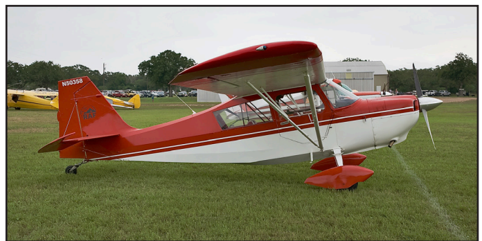
N50358, Bellanca 7ECA, msn 1286-79, ff 1979.