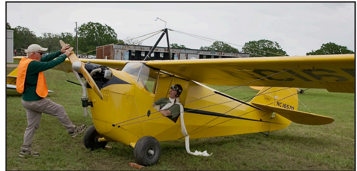
NC16570; Aeronca C-3, msn A706, ff 1936.