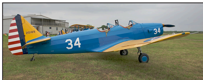
N48671, Fairchild M-62A, msn T41-1191, ff 1941; ex USAAF 41-20189.