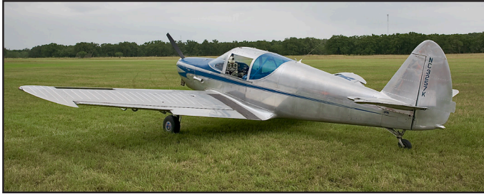
N3257K, Globe GC-1B, msn 1250, ff ?