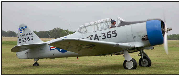
N365TA, North American NA-168: T-6G, msn 168-479, ff 1951, ex USAF 49-3365, Spain AF E.16-98 (coded 74-98, 793-18), N5830X, N496DK.