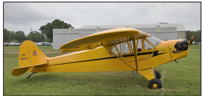
NC98521, Piper J3C-65, msn 18729, ff 1946.