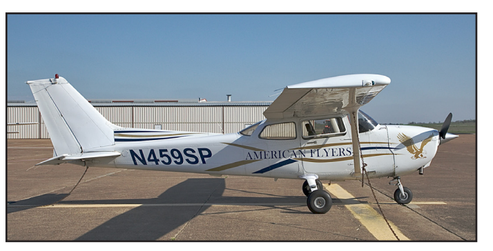
N459SP, Cessna 172S, msn 172S-08325, ff 1999.