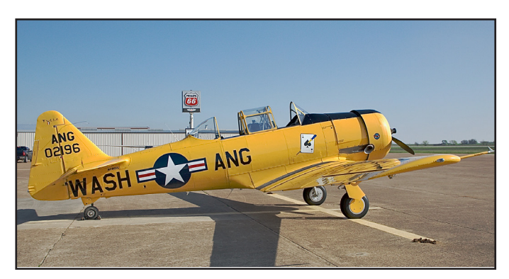
N196FC, North American NA-81 Harvard II, msn 81-41221; ex RCAF BW196.