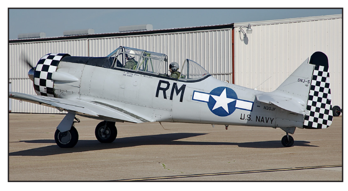
N30JF, North American SNJ-5, msn 88-16411; ex USAAF AT-6D 42-84630, USN 44009, N6639C.