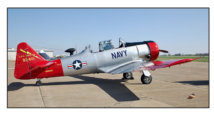
N888WV, North American NA.168: T-6G, msn 168-525, ff 1951; ex USAF 49-3401, Spain AF E.16-115 (coded 74-115, 793-37), N4995P.