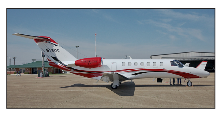
N13DC, Textron 525B, msn-525B-0677, ff 2022.