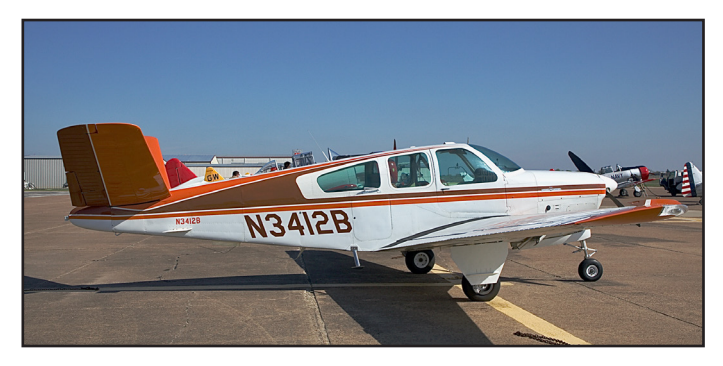
N3412B, Beech Bonanza D35, msn D-03650, ff 1953.