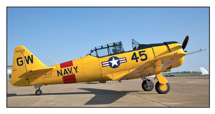
N545GW, North American AT-6 built 1994/5 by Gary A Witford with FAA msn