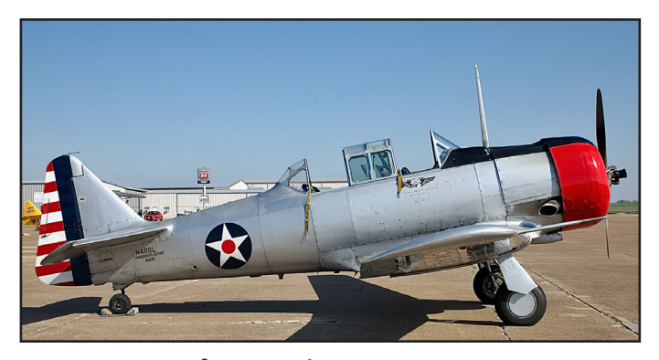
N46SL, North American SNJ-4, msn 88-12028; ex USN 27129.