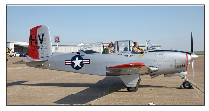
N6849C, Beech T-34A, msn G-118; ex USAF 53-3357.