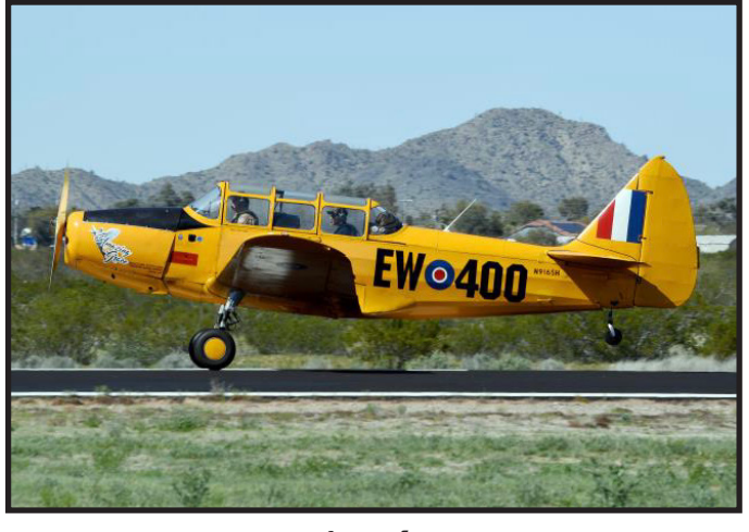
Continued on page 6...