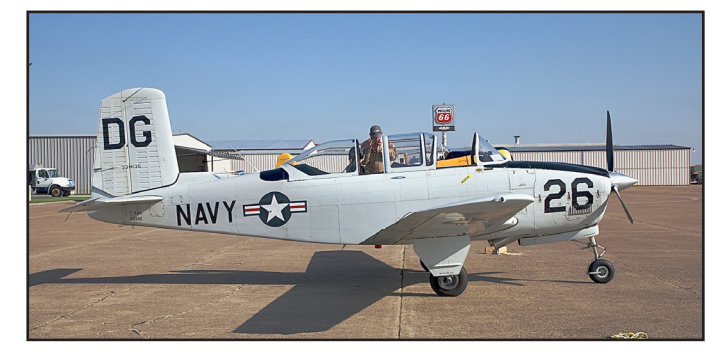
N834G, Beech T-34A (built by Canadian Car & Foundry), msn CCF34-095; ex USAF 53-4126.