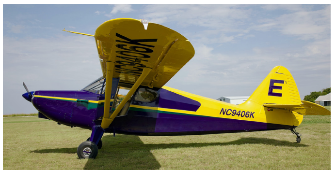
NC9406K, Stinson 108, msn 108-2406, ff 1947.