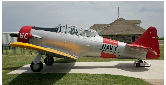
NN7406C, North American SNJ-4, msn 88-1432, ff 1943; ex USN 51654, CF-LQQ.