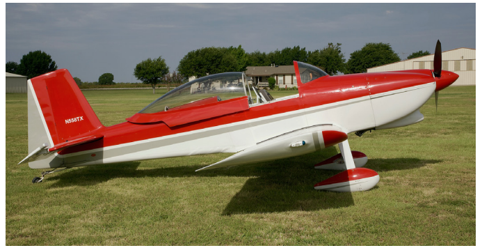
N558TX, Vans RV-8 (Schad, Tom), msn 81353, ff 2005.