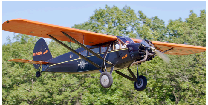
NC9038, Curtiss Wright Travel Air 6-B, msn

That is it for this month. See you all at Gainesville [GLE], TX on October 13th and 14th.