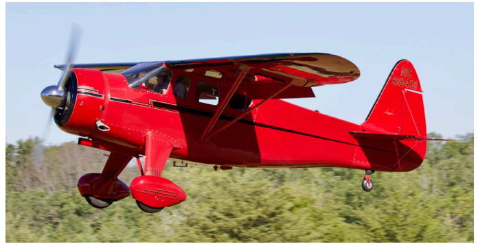
NC68431, Howard DGA-15P, msn 991, ff 1943.