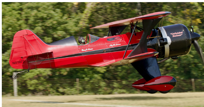
N81973, Sorenson BF9-2, msn 24601-001, ff 2008; third of the "Bendix racers to arrive.