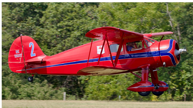
NC16522, Waco YKS-6, msn 4513, ff 1939; first of the "Bendix" racers to arrive.

In the last month have visited the Minnesota CAF Wing, Owatonna, MN, breakfast fly-in; the AAA/APM Annual fly-in at Blakesburg, IA; the National Stearman fly-in at Galesburg, IL; and the MAAC fly-in at Brodhead, WI. In this issue am going show those aircraft that caught my eye at Blakesburg.