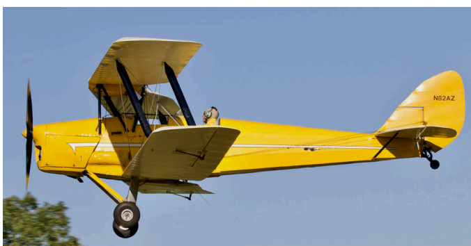
N82AZ, DH82A Tiger Moth, msn DHA-154, FAA serial A17-153, ff 1940; ex RAAF