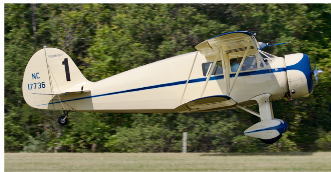
NC17736, Waco YKS-7, msn 4665, ff 1937; second of the "Bendix" racers to arrive.