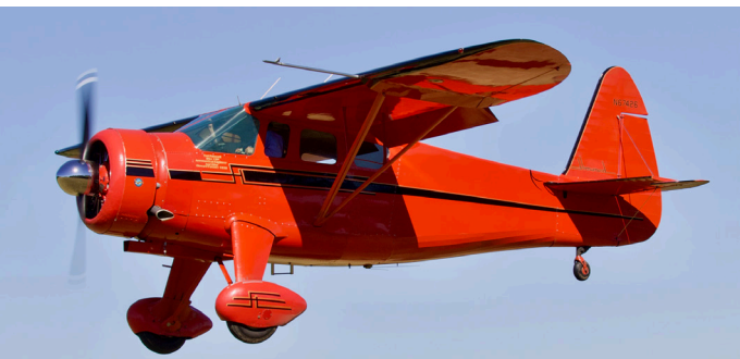
N67426, Howard DGA-15P, msn 1710, ff ?