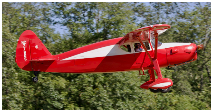
NC77605, Fairchild 24W-46, msn W46-305; TXAAA Chapter award winner.