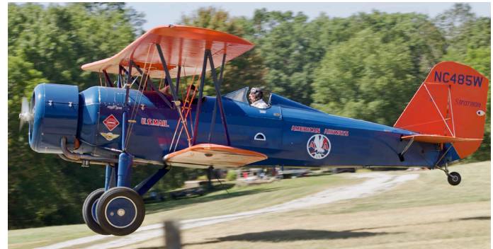
NC485W, Stearman 4E, msn 4033, ff 1931.