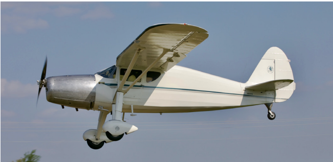
N52271, Monocoupe 90AF, msn 860, ff 1945.