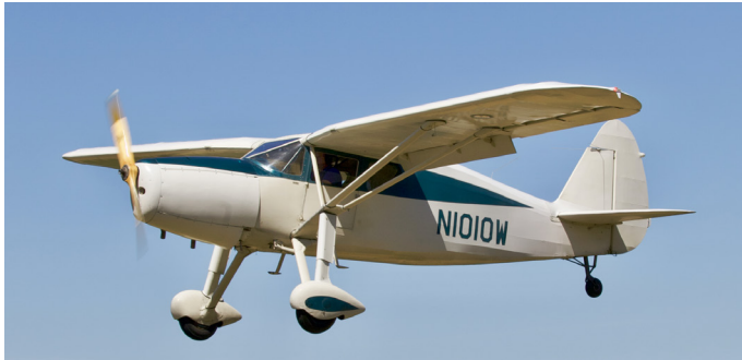
N1010W, Fairchild 24R-9, msn R46-253, ff 1946.