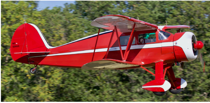
NC50662, Waco ZKS-7, msn 5221, ff 1939.