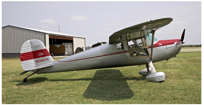
NC1663V, Cessna 140, msn 13835, ff 1947.