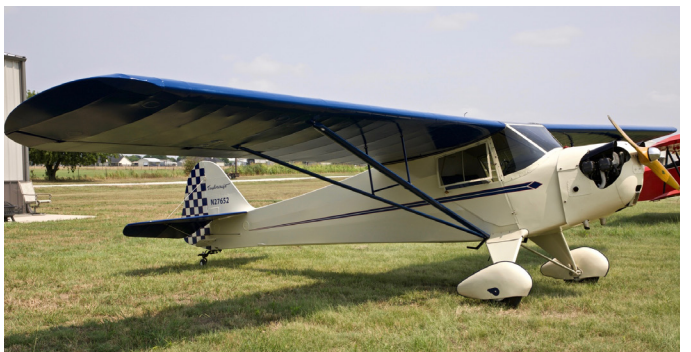
NC1663V, Cessna 140, msn 13835, ff 1947.