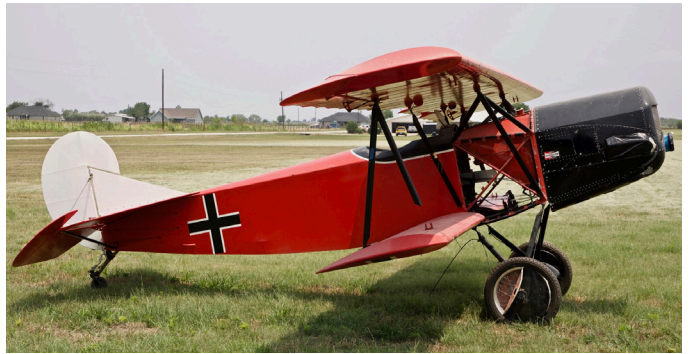
N1917F, 7/8-scale Fokker D.VII, msn 1; ff 1967; presently under restoration and not still registered.