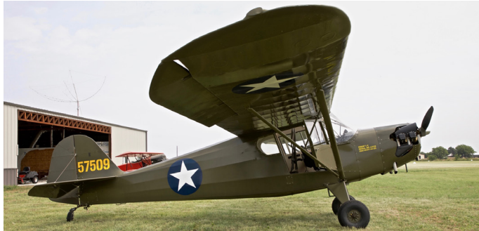
N57509, Taylorcraft DCO-65, msn 5122, originally built as an L-2.