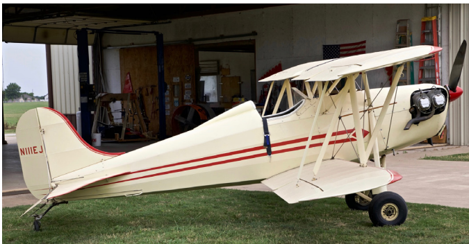
N111EJ, Gypsy Rose (Jankow, Edward M), msn 001, ff1993, is a Rose Parakeet replica.

Aircraft present at Tailwheel Acres included the following: