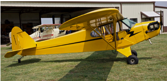
NC92454, Piper J3C-65, msn 16924, ff 1946.

The following was my favorite aircraft from the Smithville fly-in: