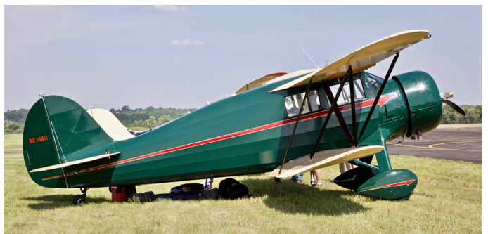
NC14611, Waco UKC-S, msn 3978, ff 1935.