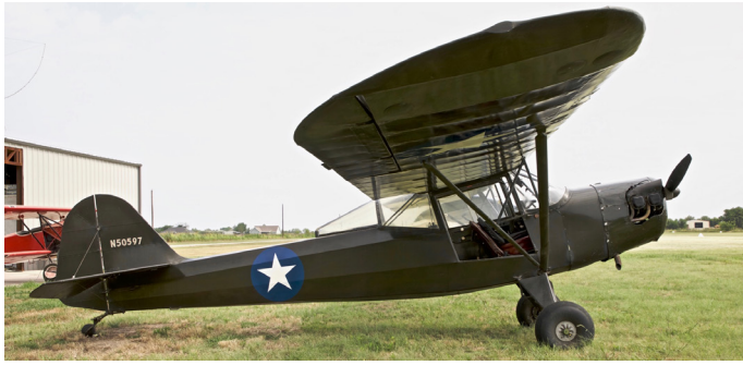
N50597, Taylorcraft DCO-65, msn 4459, ff 1942; ex USAAF 42-35998.