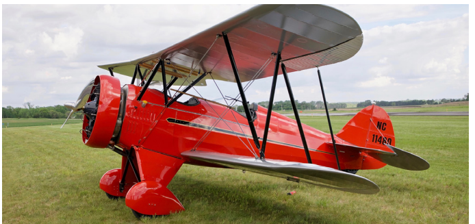
NC11480, Waco QCF-2, msn 3556, ff 1931.