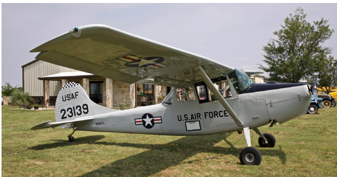
N194TX, Cessna O-1A, msn 23139, ff 1951.