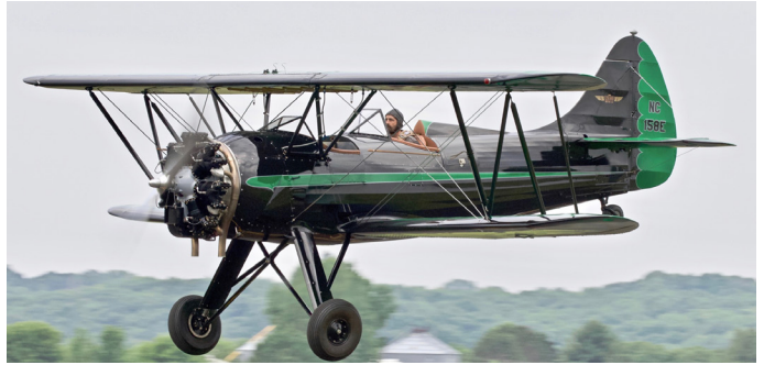
NC158E, Waco UPF-7, msn 5577, ff 1940.

Now a few from the First Ditch fly-in at Le Sueur, MN [with more to follow next month]: