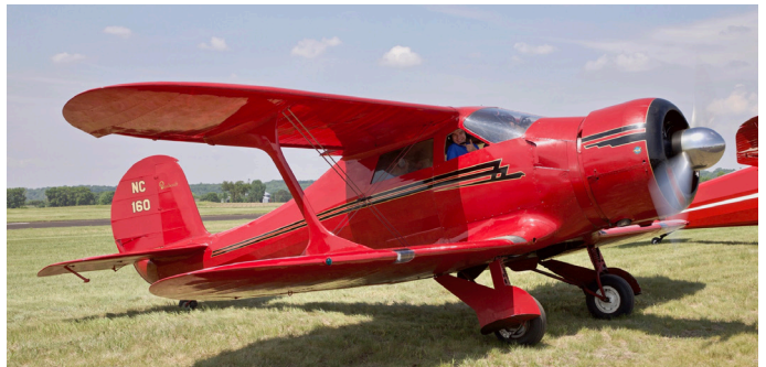
NC160, Beech D17S, msn 4836, ff 1943.