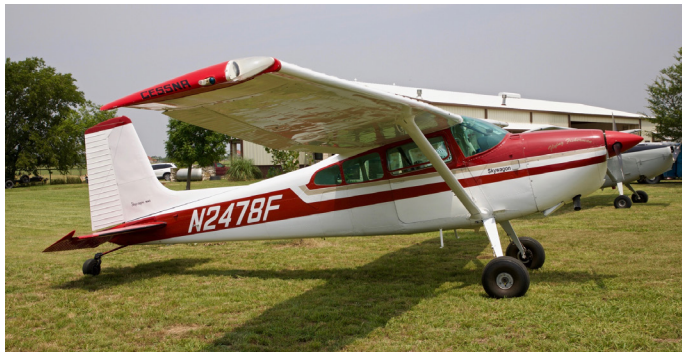
N2478F, Cessna 180H, msn 180-51680, ff 1966.