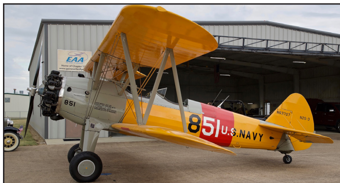
N63707, Boeing Stearman B75N1, msn 75-6938, ex USN 07334, ff 1942.