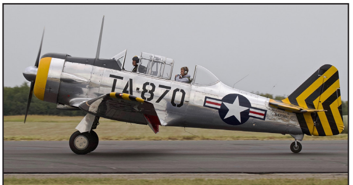
N4708C, North American NA.121: AT-6F, msn 121-42592, ex USAAF 44-81870.