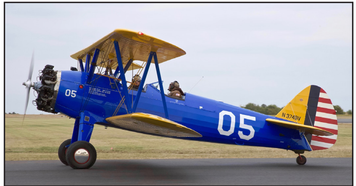
N374BV, Boeing Stearman D75N1, msn 7503801, ex USAAF 42-15612, RCAF FJ751, USAF 45-15612, N54805, ff 1942.