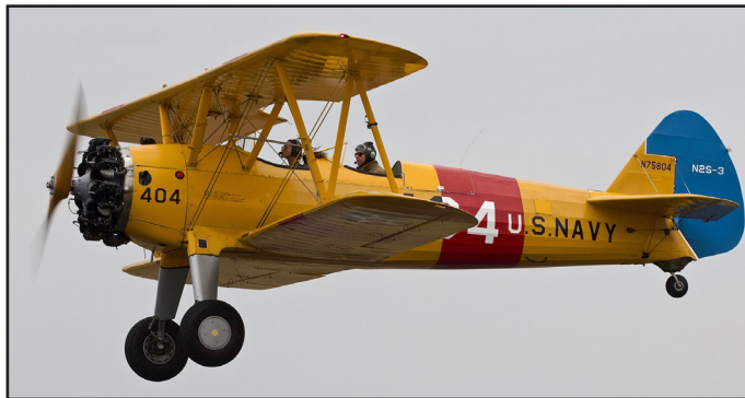
N75804, Boeing Stearman B75N1, msn 75-1291, ex USN 3514, ff 1941.