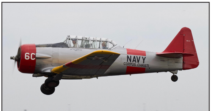
N7406C, North American NA.88: SNJ-4, msn 88-14342, ex USN 51654, CF-LQQ, ff 1943.