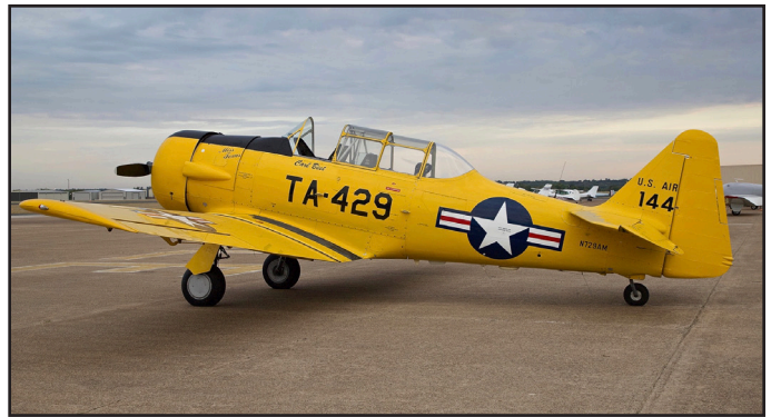
N729AM, North American NA.182: T-6G, msn 182-116; ex USAF 51-14429, French AF 114429, ff 1951.