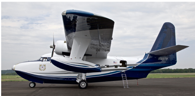
N99TP, Grumman HU-16, msn G-295 [Grumman]/99-7218 [FAA], ff 1951; ex USAF 51-7218, USCG 7218, N7029F.