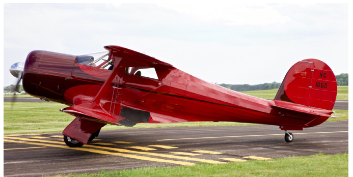
NC1660D, Beech G17S, msn 6766, ff 1944.