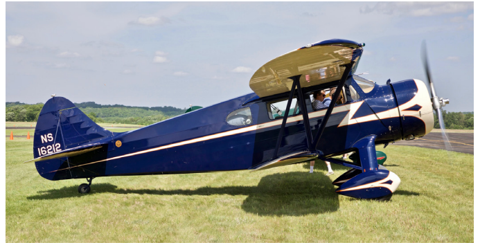
NS16212, Waco YQC-6, msn 4402, ff 1936.

The rest of the photos were taken at Vintage Aviation's First Ditch Fly-in at Le Sueur, MN, June 1st - 4th, 2023.