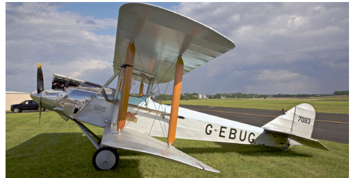
N7083, Avro 594 Mk.4, msn R3-AV-127, ff 1927; ex G-EBUG.