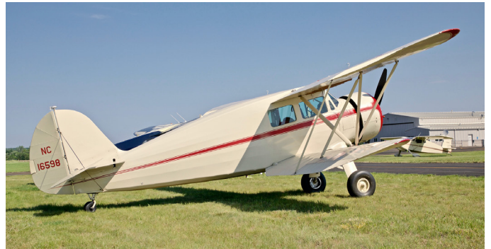
NC16598, Waco YKS-6, msn 4522, ff 1936.