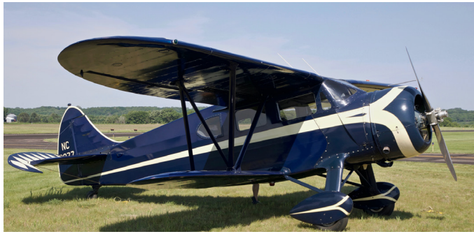
NC2277, Waco ZQC06, msn 4446, ff 1936.