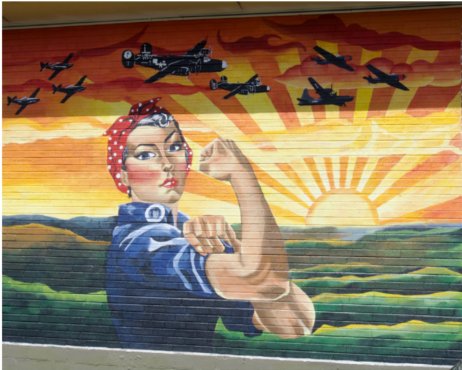
The "Rosie the Riveter" mural unveiled at the Rose Garden of the Vintage Flight Museum at Meacham Field on July 8th.

The only event that I have attended since the June meeting was the unveiling of the "Rosie the Riveter" Mural in the rose garden at the Vintage Flight Museum, Meacham Field on July 8th: