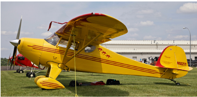
N52271, Monocoupe 90AF, msn 860, ff 1945.