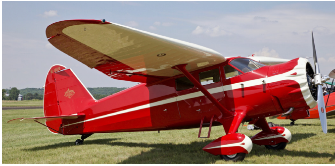
NC18424, Stinson SR9FM, msn 5729, ff 1937.