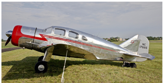
NC17665, Spartan 7W, msn 31, ff 1940.