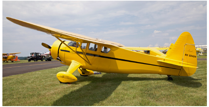
NC22424, Howard DGA-15P, msn 523, ff 1940.