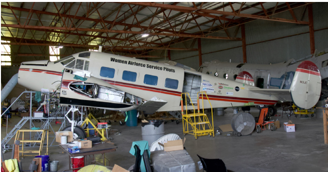
N13JC, Jackie Cochrane's Beech E18S, msn BA-31, ff 1954, being restored at the Vintage Flight Museum.

The rest of the photos were taken at Vintage Aviation's First Ditch Fly-in at Le Sueur, MN, June 1st - 4th, 2023.