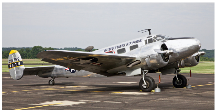
N8504, Beech C-45H, msn AF-682, ff 1952; ex USAF 52-10752.