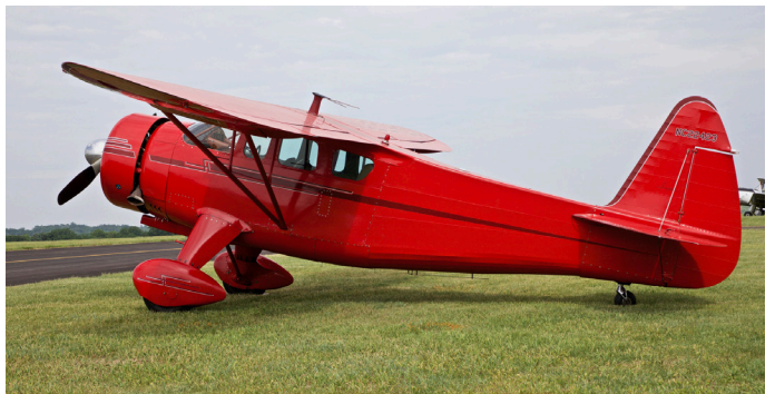
NC22423, Howard DGA-15P, msn 522, ff 1940.