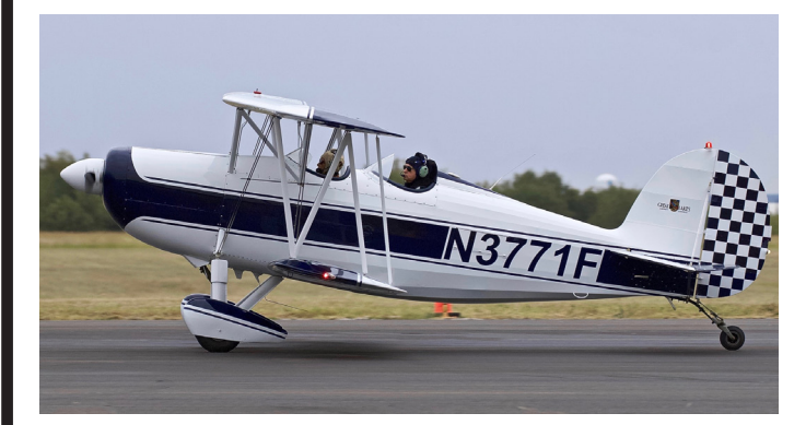
N3771F, Great Lakes 2T-1A-2, msn 764, ff 1977.

Have a wonderful month and enjoy a fly-in somewhere.