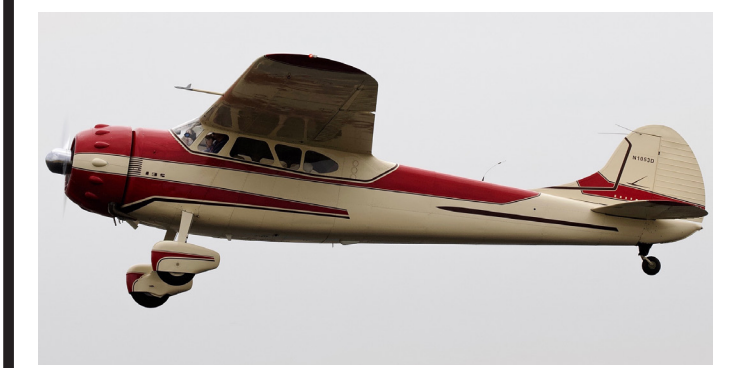
N1053D, Cessna 195A, msn 7665, ff 1951.