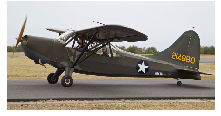
N56851, Stinson L-5, msn NL76-83; ex USAAF 42-14880.