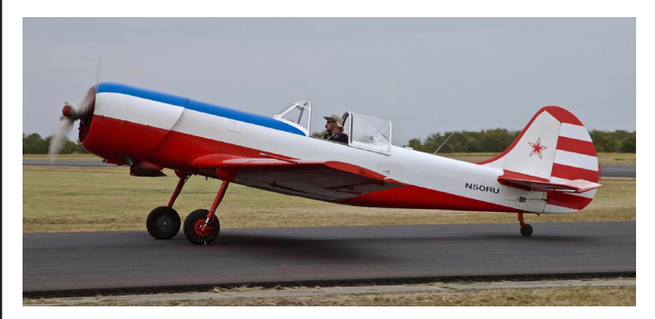
N50RU, Yakovlev Yak 50, msn 842907, ff 1984; ex-military? Additional info welcomed.