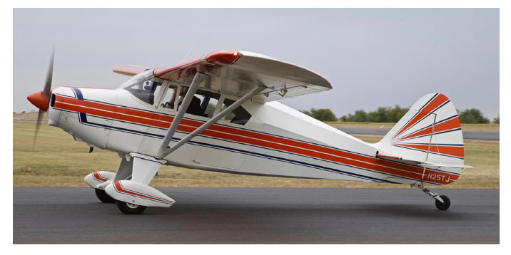
N25TJ, Piper PA-22-160 tailwheel conversion, msn 22-6676, ff 1959.