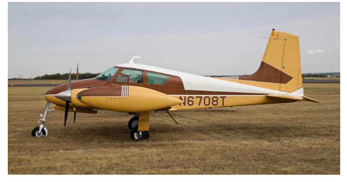
N6708T, Cessna 310D, msn 39098, ff 1960. Another bright and shiny aircraft in Friday's sun.