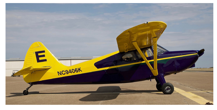
NC9406K, Stinson 108, msn 108-2406, ff 1947.