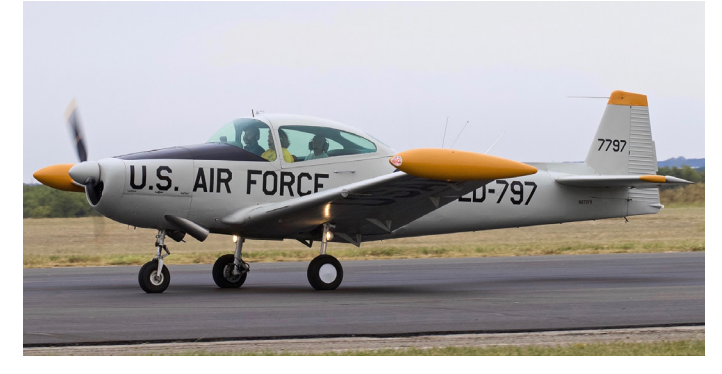
N8797H, Ryan Navion A, msn NAV-4-0797, ff 1947. Not an ex USAF aircraft.