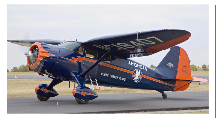
NC18407, Stinson SR-9C, msn 5313, ff 1937.