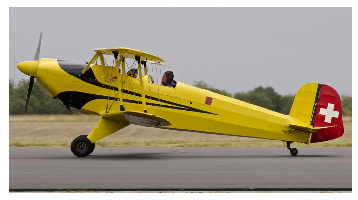
N131FD, Bucker 131 (Aero Z), msn 146, ff 1947; ex OK-AOZ, HB-USZ, D-ELFY.