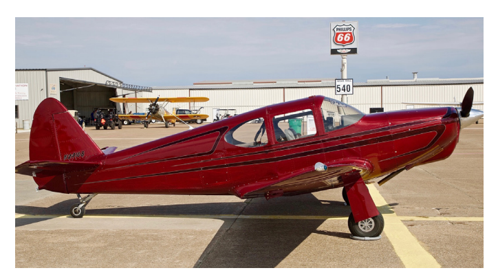
N2410B, Globe GC-1B, msn 3710, ff 1949. Bright and shiny in the sun on the Friday.