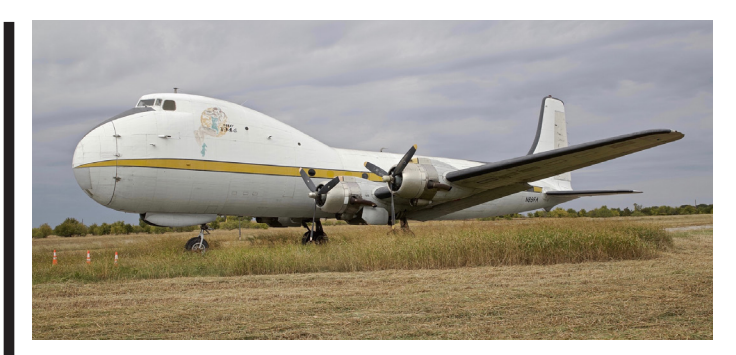
N89FA, Douglas C-54, msn 27249; ex USAAF 44-9023, N88816, XA-MAA, HP-268, XA-MAA, CP-682, N9326R; converted to ATL-98 Carvair (#9 of 21) in 1962, G-ASHZ.