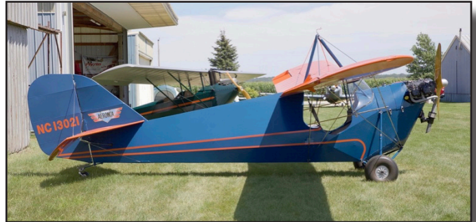
NC13021, Aeronca C-3, msn A-236, ff 1932. Brodhead.