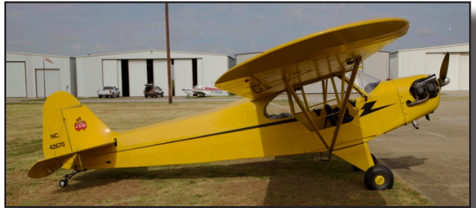
NC42670, Piper J3C-65, msn 14964, ff 1945.