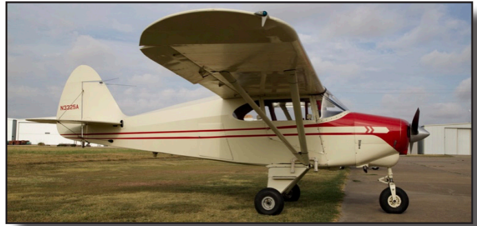
N3325A, Piper PA-22-135, msn 22-1609, ff 1953.