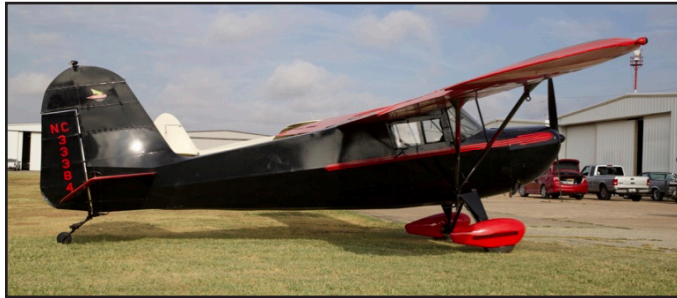
NC33384, Commonwealth 185, msn 1605, ff 1945.