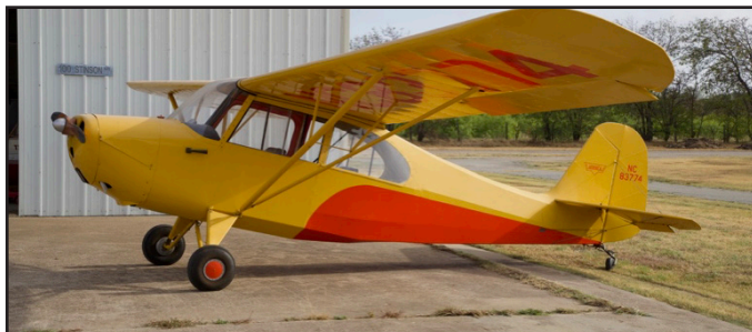
N83774, Aeronca 7AC, msn 7AC-2451, ff 1946.