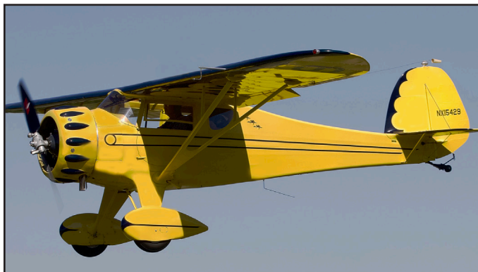
NNX15429, Monocoupe 90A, msn A730, ff 1936, with wing panel over port fuel tank partly detached. Blakesburg, IA, AAA Fly-in.