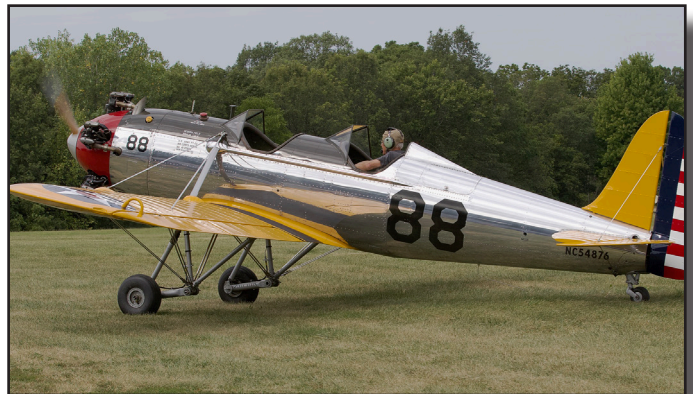
NC54876, Ryan ST3KR, msn 2097, ff 1942; TXAAA Chapter Choice Award. Blakesburg, IA, AAA Fly-in.