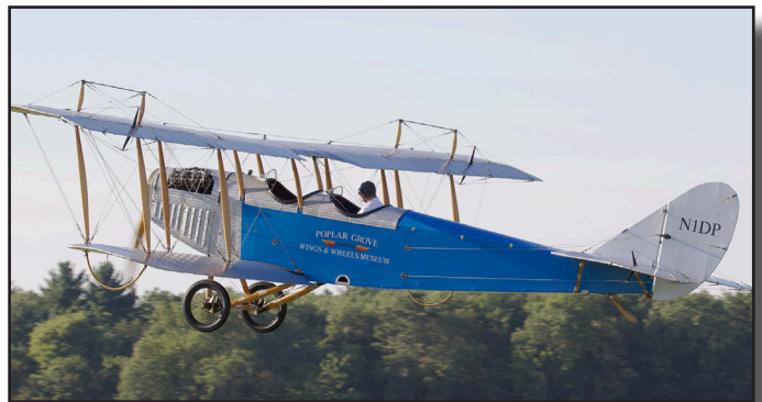
N1DP, Curtiss JN-4D, msn 7685. Brodhead, WI, MAAC Fly-in.