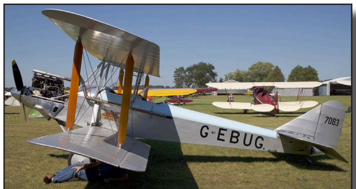
N7083/G-EBUG, Avro 594 Mk.4 Avian, msn R3-AV-127, ff 1927. Brodhead, WI, MAAC Fly-in.