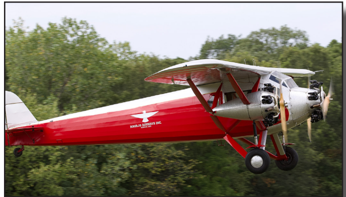
NC-612A, Kreutzer K-5, msn 102, on delivery flight. Blakesburg, IA, AAA Fly-in.