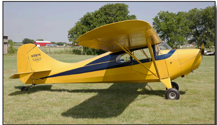
N3187E, Aeronca 11BC, msn 11AC-1536, ff 1946.