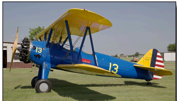
N588A, Stits SA-3A Playboy, msn HS-1, ff 1966.