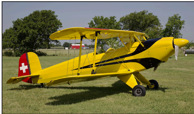
N131FD Bucker 131 (Aero Z), msn 146, ff 1947