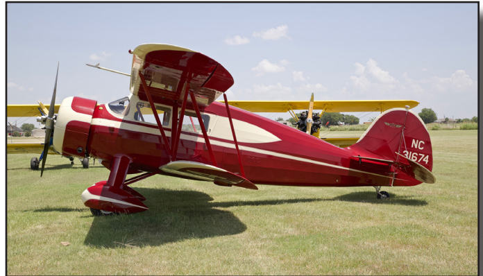
NC31674, Waco VKS-7F, msn 6115, ff 1942.