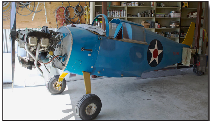
N588A, Stits SA-3A Playboy, msn HS-1, ff 1966.