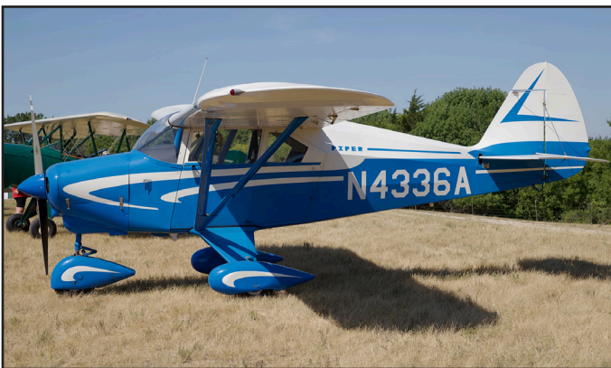
N4336A, Piper PA-22, msn 22-3691, ff 1956.