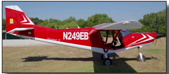
N249EB, ICP Srl Savannah S, msn 21-10-54-0816, ff