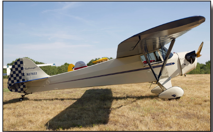
N27652, Taylorcraft BL-65, msn 2294, ff 1940.