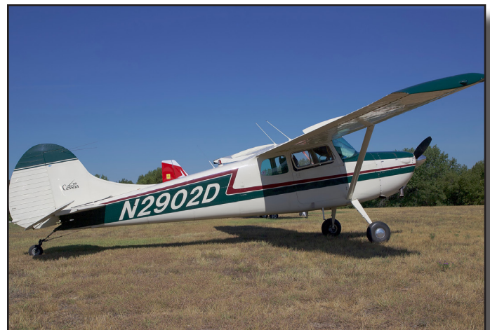
N2902D, Cessna 170, msn 26845, ff 1955.