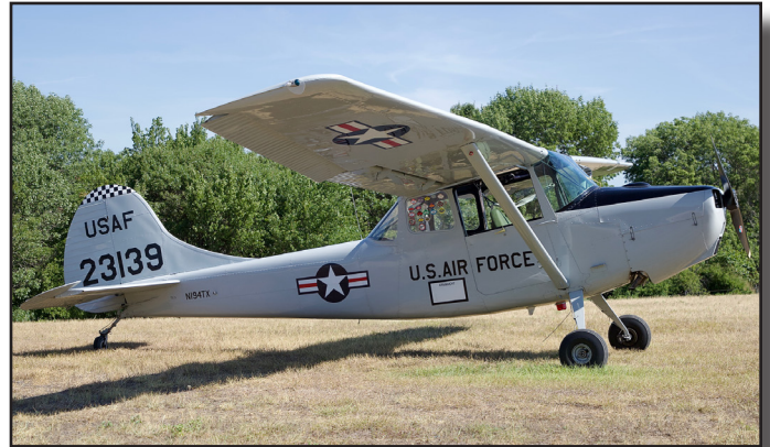
N194TX, Cessna 305/O-1A, msn 23139, ff 1951.