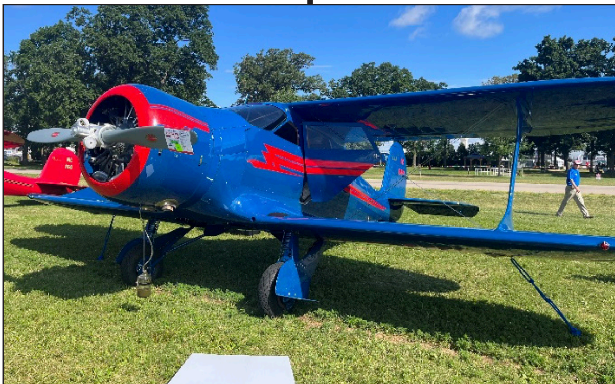
1939 Beechcraft Staggerwing