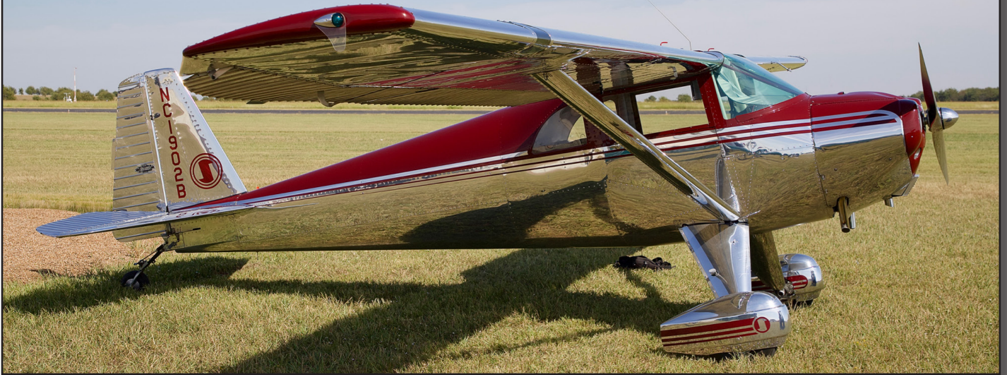
Best Classic, Luscombe 8F, msn 6329, ff 1948