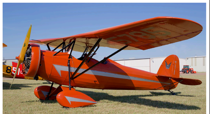
Best Antique, Davis D-1-W, msn 801, ff 1935, N15785[C]