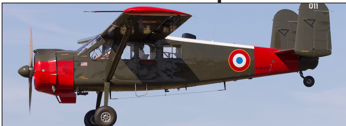
Best Neo-Classic, Max Holste MH.521 Broussard, msn 011, ff 1961