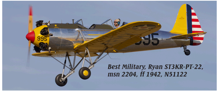
Best Military, Ryan ST3KR-PT-22, msn 2204, ff 1942, N51122