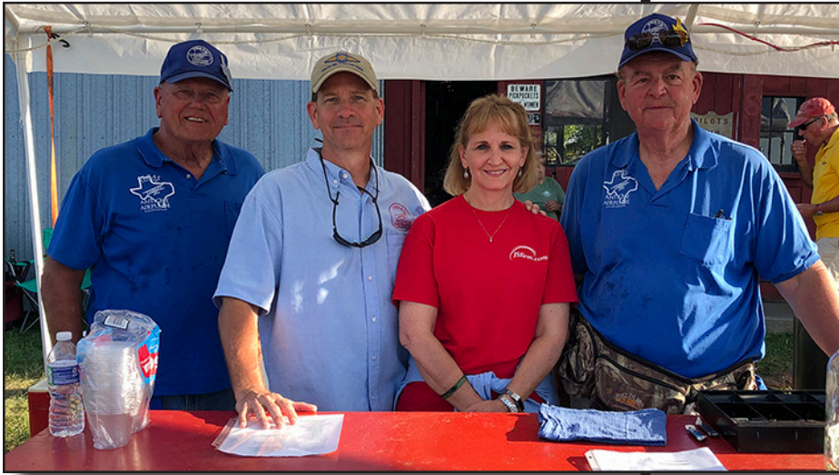
Our Blakesburg 2020 Saturday Volunteer Bartender Crew