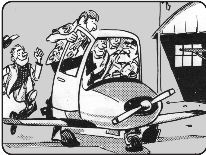
PYLON - All aboard!

Many 0235/0320 engine parts for sale. Carb parts, oil pan, cases, cylinders, fly wheel, bearings, lifters, ETC. Contact Jack Weiland at 682-262-3528