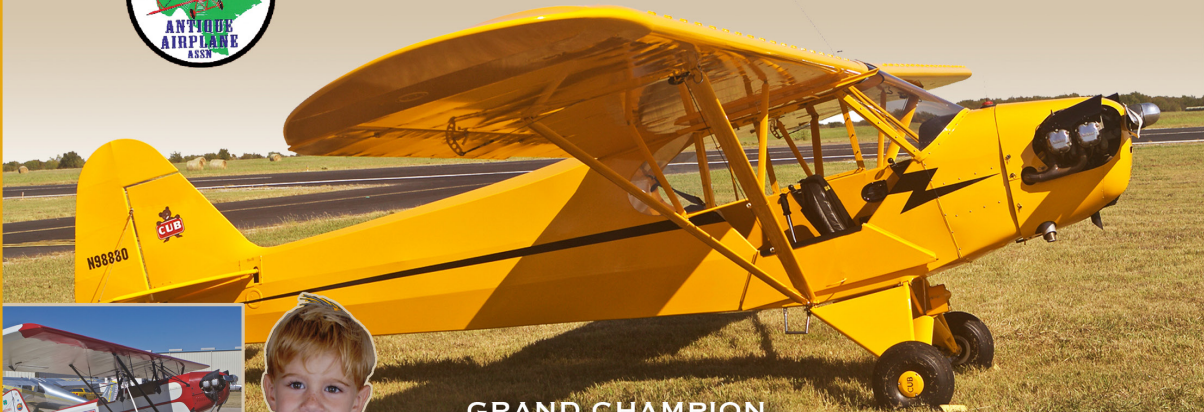
GRAND CHAMPION 2017