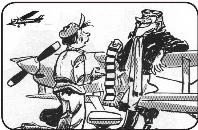
SUPERCHARGER - Hot pilot with eight credit cards.