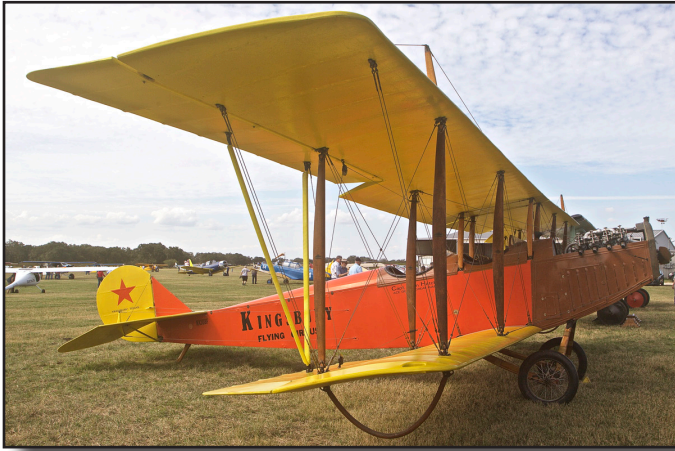
JN-4C Canuck, N308F[X]