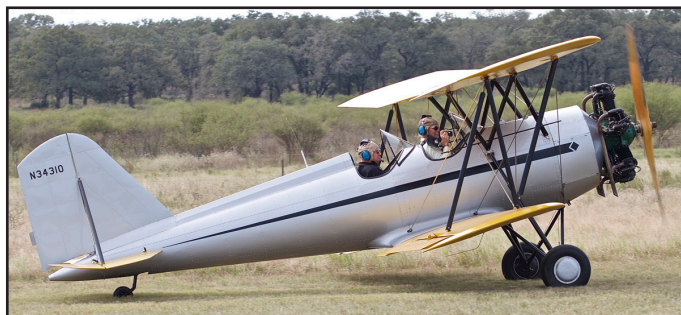
Meyers OTW, N34310