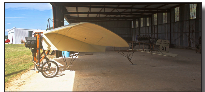
Bleriot XI replica, N1909E[X]