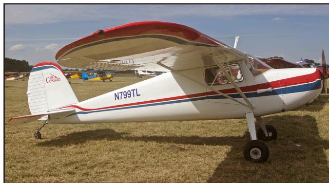
Cessna 120, N799TL