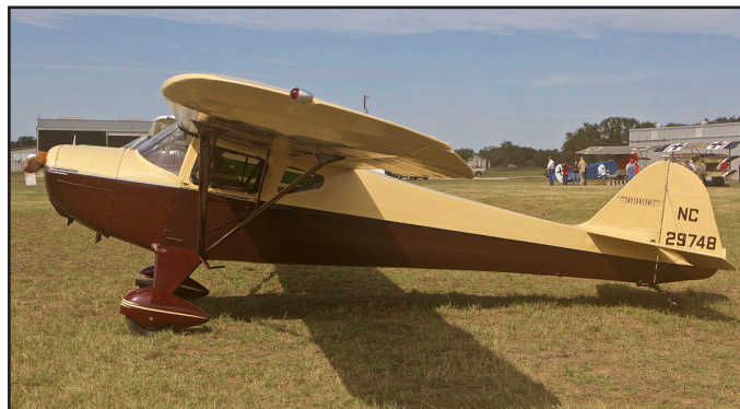
Taylorcraft BC12-65, N29748[C]