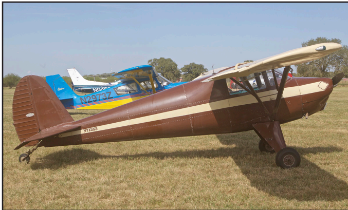
Luscombe 8A, N71353