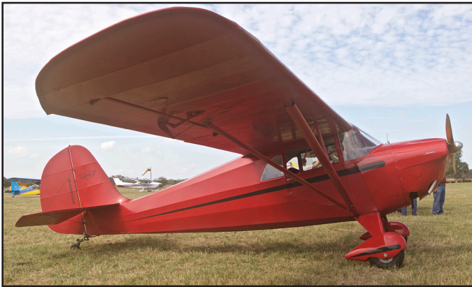
Aeronca 65-CA, N29206[C]