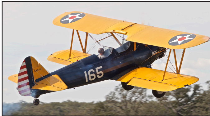
Boeing Stearman A75N1, N59767