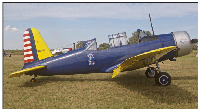
Vultee BT-13A, N826BT