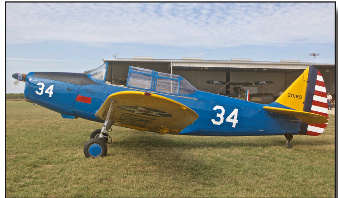
Fairchild M-62A, N48671