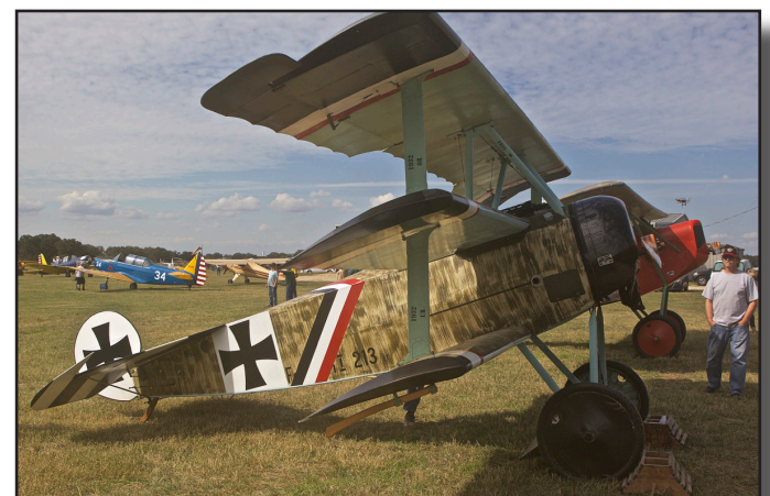
Fokker Dr.1 replica N1917H