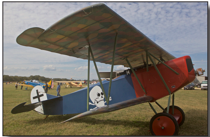
Fokker D.VII replica, N1918H