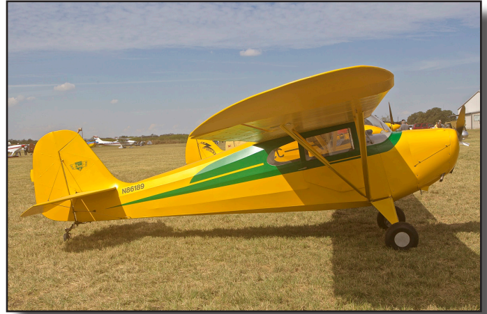
Aeronca 11AC, N86180