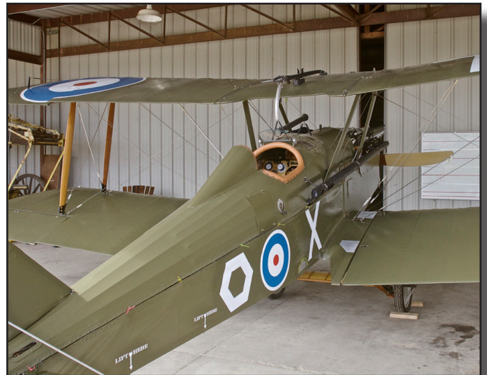
SE-5A, 22D6851 New Construction Awaiting Radiator