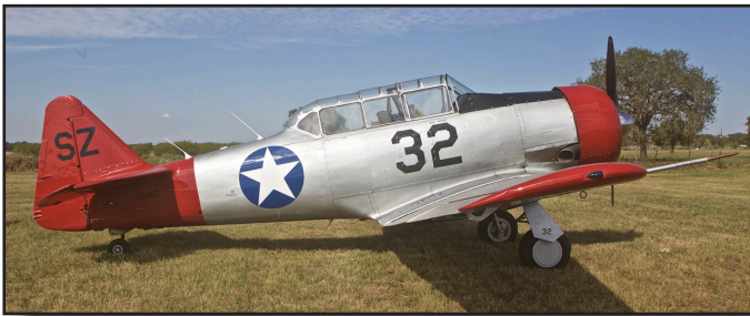
North American T-6G, N32SZ, ex USAF