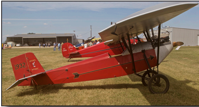
Pietenpol Sky Scout, N1932G