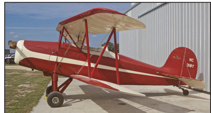
Great Lakes replica, N318Y[C]