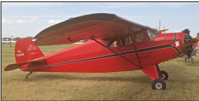
Aeronca 65-CA, N29206[C]