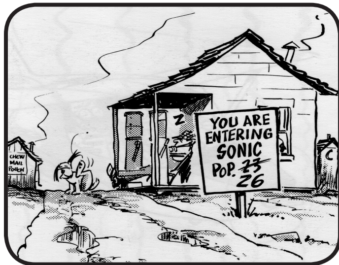
SONIC BOOM - Sudden prosperity in Sonic, Idaho.