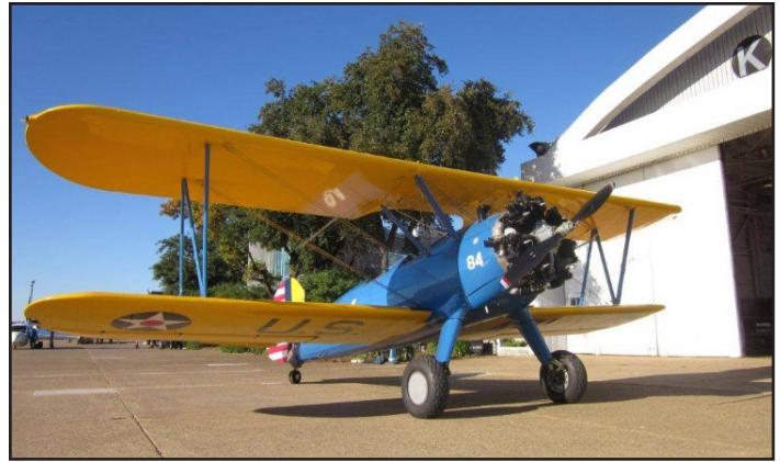
Boeing/Stearman PT-17 "Kadet"