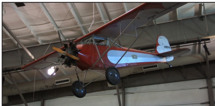
"Texas Temple" Sportsman Monoplane