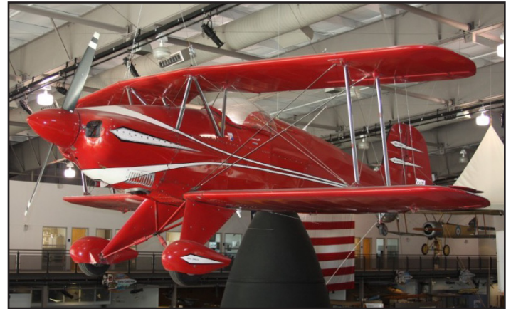
Bucker BU133 "Jungmeister"