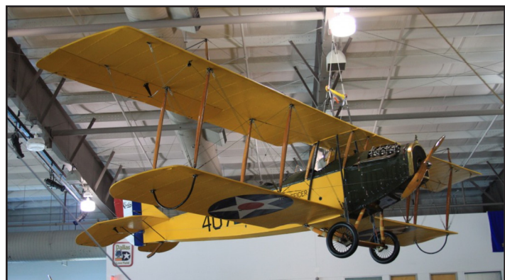
Curtiss JN-4D "Jenny"