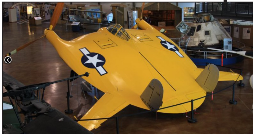
Chance Vought V-173 "Flying Pancake"