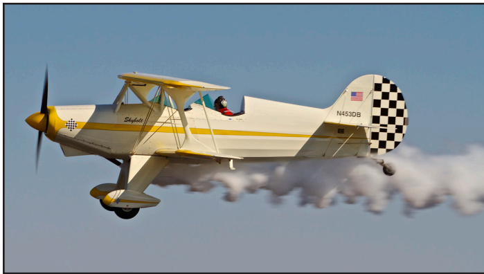
Experimental Plans-built: N453DB, Skybolt, finished 2012, built and owned by Don Baker.