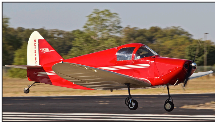
Antique, to 1941 Closed Cockpit: N32482, Culver LCA, built 1941, owned by Tom Wood.