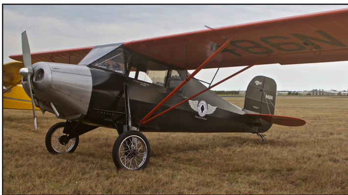
Experimental Legacy: N486N, Corbin Cabin Ace SJ, built 2013, built and owned by Steve McGuire.