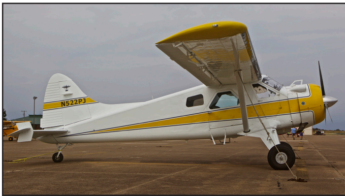
Grand Champion: N522PJ; DeHavilland DHC-2 Mk.1 "Beaver", built 1950, owned by Russell Armstrong.