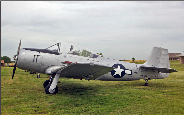
N5726, 1947 Fairchild XNQ-1