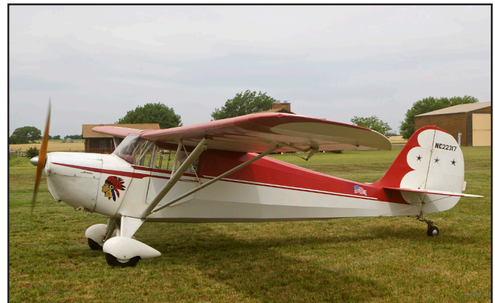
NC22317, 1939 Aeronca 65-C