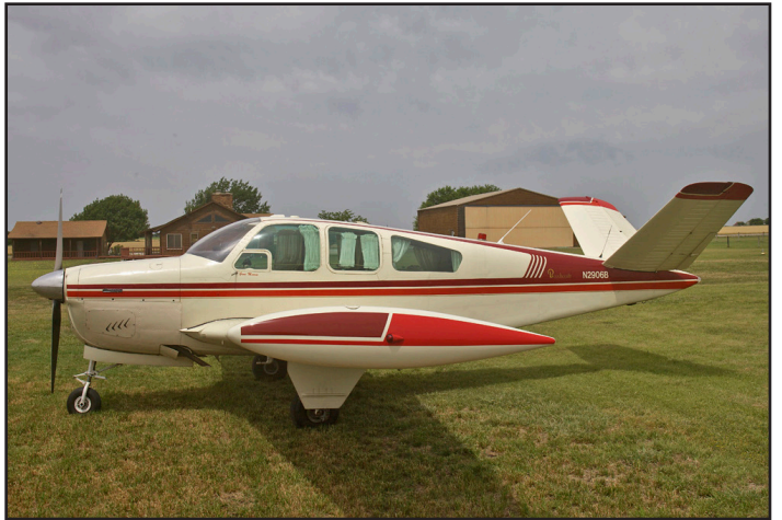
N2906B, 1953 Beech Bonanza D35