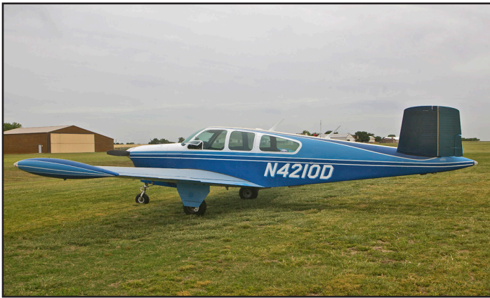
N4210D, 1955 Beech Bonanza G35