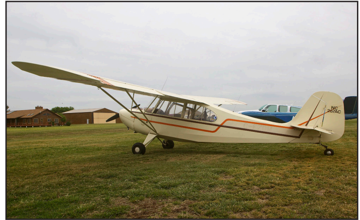
NC267AC, 1946 Aeronca 7AC