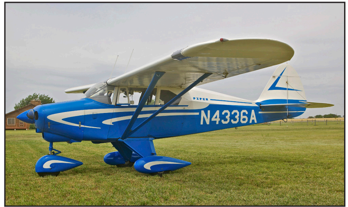
N4336A, 1956 Piper PA-22