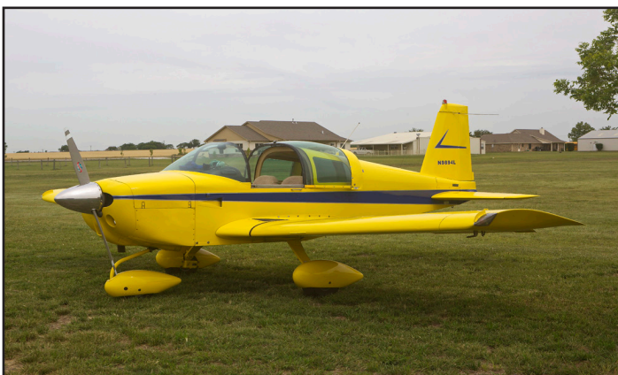
N9894L, 1974 Grumman American AA-1B