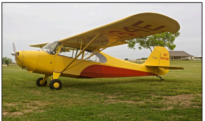
NC1864E, 1946 Aeronca 7AC