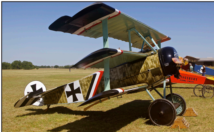
N1917H, Fokker DR.1 at Kingsbury, May 3, 2014