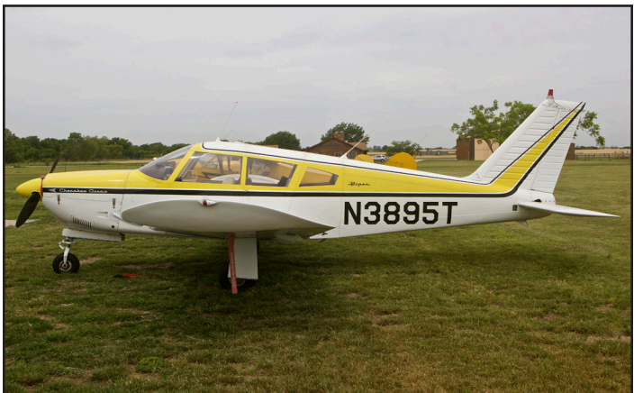
N3895T, 1967 Piper PA-28R-180