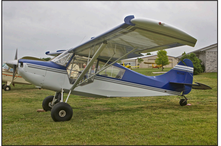
N2759A, 1946 Champion Aeronca 7DC