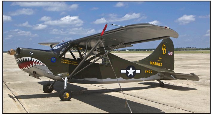
N4252K, 1944 Stinson L-5 sitting lonely in the sun outside the CAF hangar at San Marcos on May 11, 2014