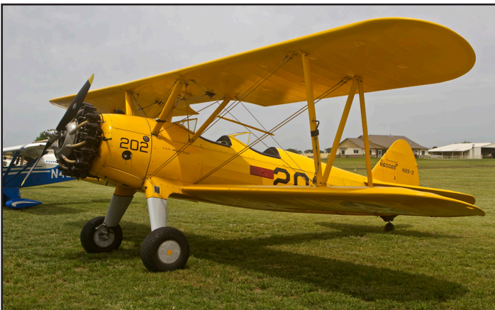
N60085, 1943 Boeing Stearman A75N1/PT-17