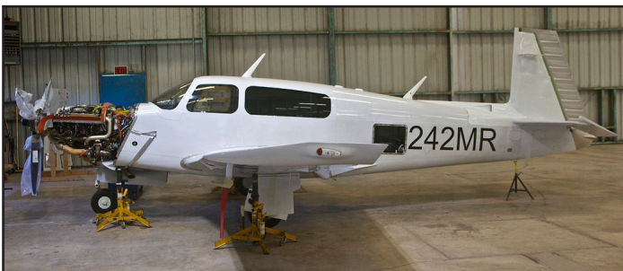
N242MR, Mooney 20TN, first aircraft off the new production line at Kerrville, May 10, 2014