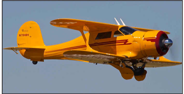
N79484, 1943 Beech D17S performing at the Central Texas Airshow, Temple, May 4, 2014