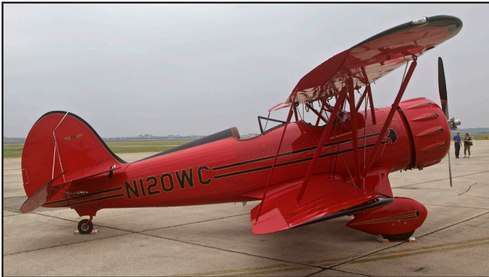
N120WC, WACO YMF-F5C recently manufactured by Waco Classic Aircraft at the AOPA fly-in San Marcos, April 26, 2014