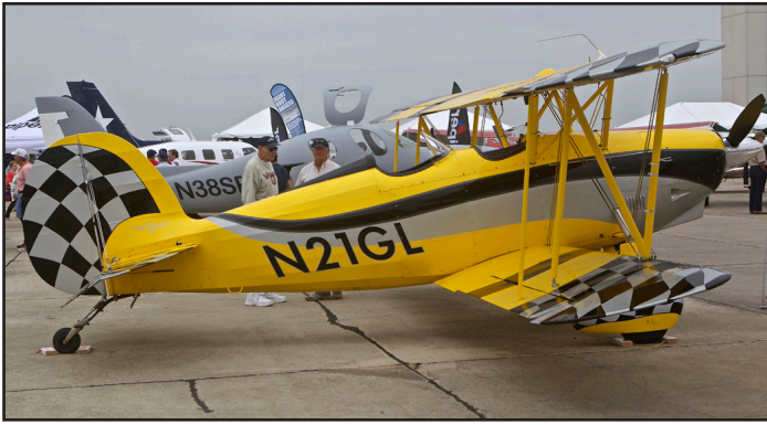
N21GL, Great Lakes 2T-1A-2 recently manufactured by Waco Classic Aircraft at the AOPA fly-in San Marcos, April 26, 2014