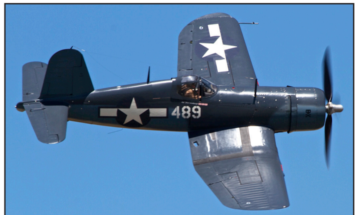
NX209TW, 1945 Goodyear FG-1D performing at the Central Texas Airshow, Temple, May 4, 2014