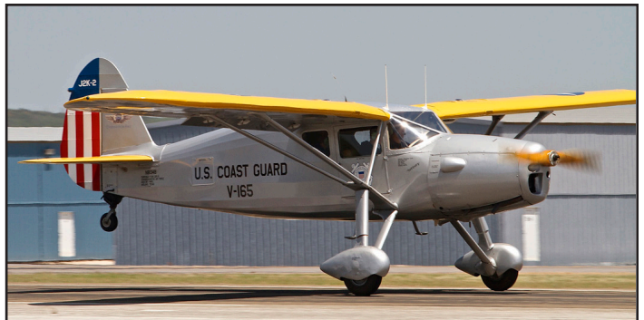
N81348, 1946 Fairchild 24R-46 of the CAF landing at Burnet, April 25, 2014 for the Bluebonnet Airshow.