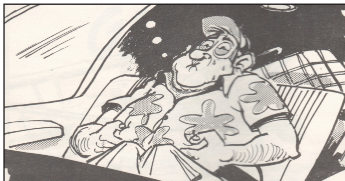
SLOW FLIGHT - Flight that extends beyond pilot and/or passenger bladder limits.

FOR LEASE - 3 miles from Bird’s Nest Airport/ Austin Executive Airport off FM 973: Large workshop, 25’ x 65’, double doors, abundant windows for a good cross-breeze. Two separate rooms at one end for office/storage, Ideal for restoration projects, wing building, hobbies, etc. Contact Bill and Shirley Girard at Shirley@mudflap-aviation.com 1/13