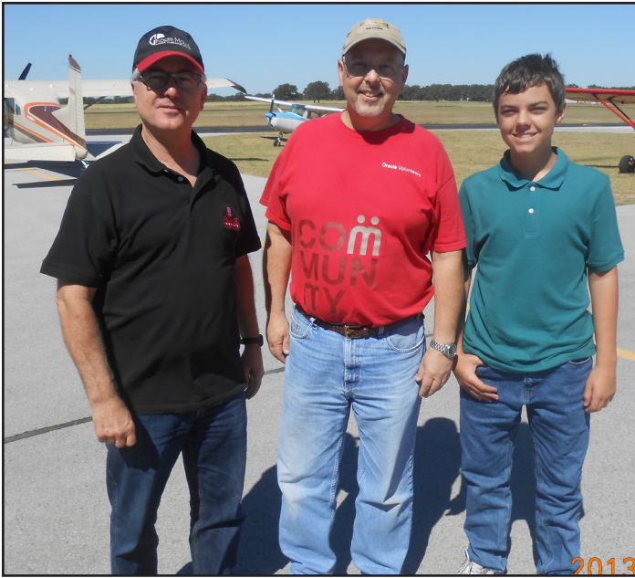
What do the two photo's below have in common?