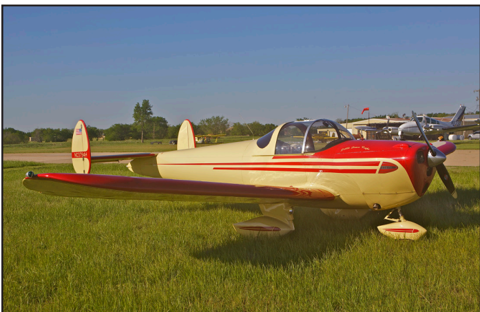
NC3794H, Ercoupe 415-C, cn 4419, built in 1947 and owned by TXAAA-member Jack Stanton.