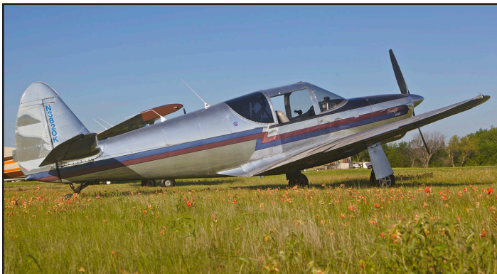
N3820K, Temco-built Globe GC-1B, cn: 3509, built in 1948 and owned by Clarence Rutter.