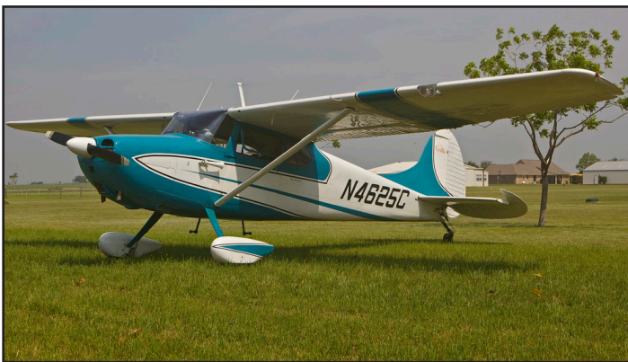
N4625C, Cessna 170B, cn: 25569, built in 1953 and owned by Gary Sublette.