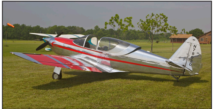
N78030, Globe GC-1B, cn: 2030, built in 1946 and owned by Stan Price.