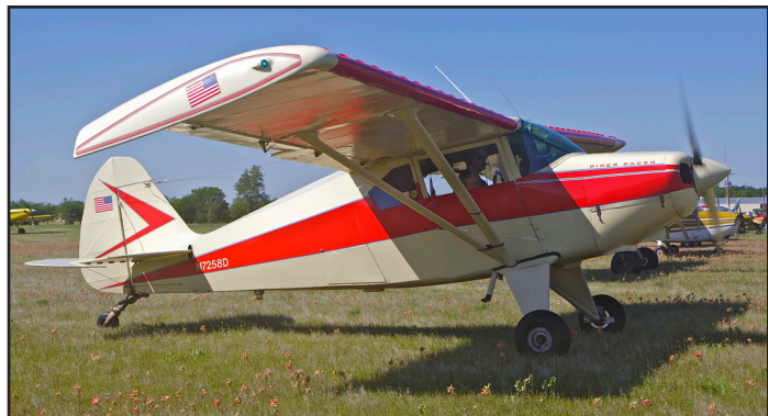
N7258D, Piper PA-22-150, owned by Jack Wiesel, cn: 22-5085, built in 1957 and converted back to PA-20 tail-dragger configuration. The squared-off rear window is indicative of the original Tri-Pacer.