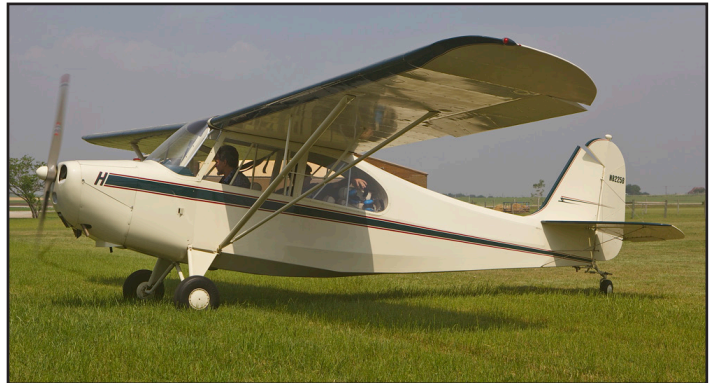
N82258, Aeronca 7AC, cn: 7AC-0886, built in 1946 and owned by Todd Heffley.