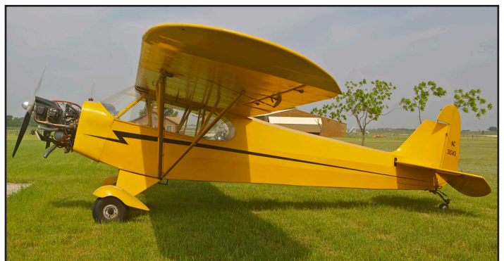
NC31043, Piper J3C-65, cn: 5278, built in 1940 and owned by Don Pellegrino.