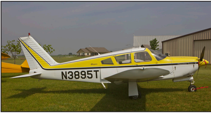
N3895T, Piper PA-28R-180, cn: 28R-30224, built in 1967 and owned by Don Pellegrino.