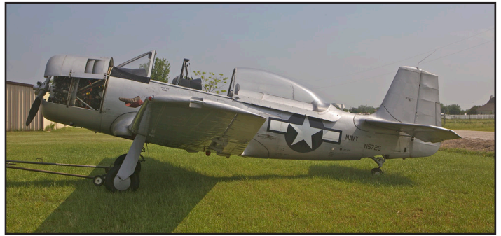
N5726, Fairchild XNQ-1, cn: 75726, built in 1947 and owned by Don Pellegrino. One of two flying prototypes originally developed for, but rejected by, the U S Navy. The U S Air Force contracted for 100 of the aircraft (to be designated T-31), but the order was cancelled in favor of the Beech T-34 according to Wikipedia.