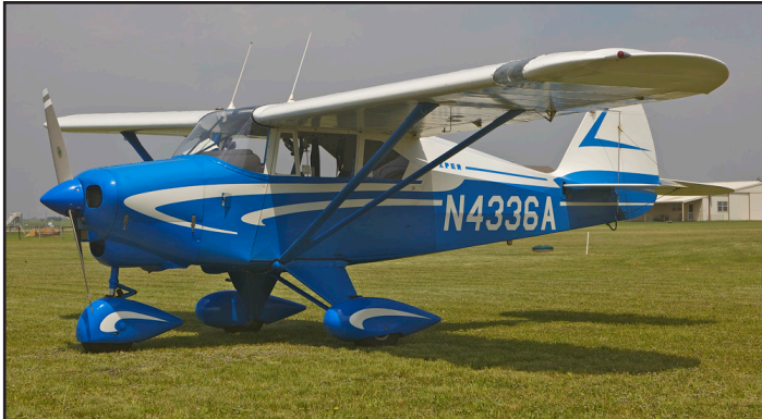
N4336A, Piper PA-22, cn: 22-3691, built in 1956 and owned by Bruce Putney. Note the squared-off rear window.