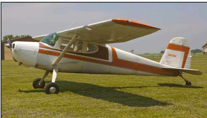
N5633C, Cessna 140A, cn:15586, built in 1950 and owned by Brandon Hughes.