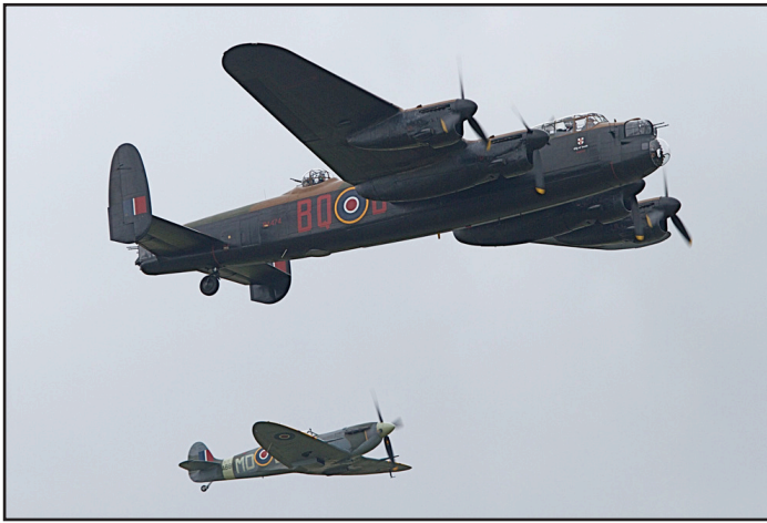
Vickers Supermarine Spitfire Mk.Vb, AB 910 and Avro Lancaster B.1, PA474, operated by the Royal Air Force Battle of Britain Memorial Flight at the Farnborough Air Show on July 9, 2012.