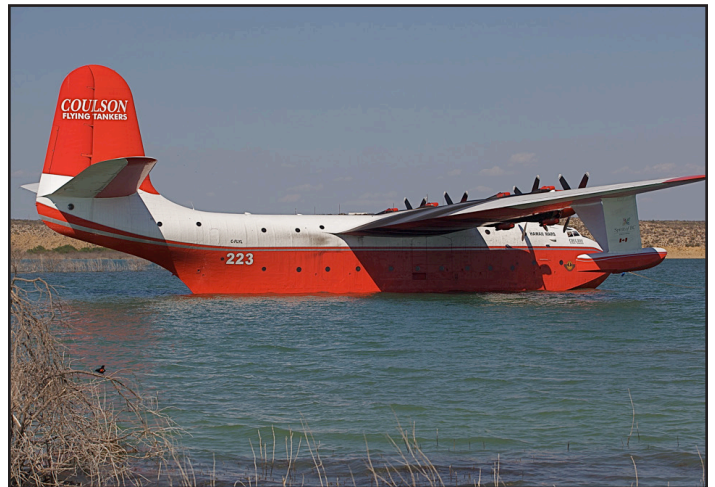
Martin JRM Mars flying boat, C-FLYL, ex: U S Navy 76823, operated by Coulson Airplane Ltd as a water bomber, cooling off in Lake Amistad on May 17, 2011 at the end of a season fighting fires in Mexico.