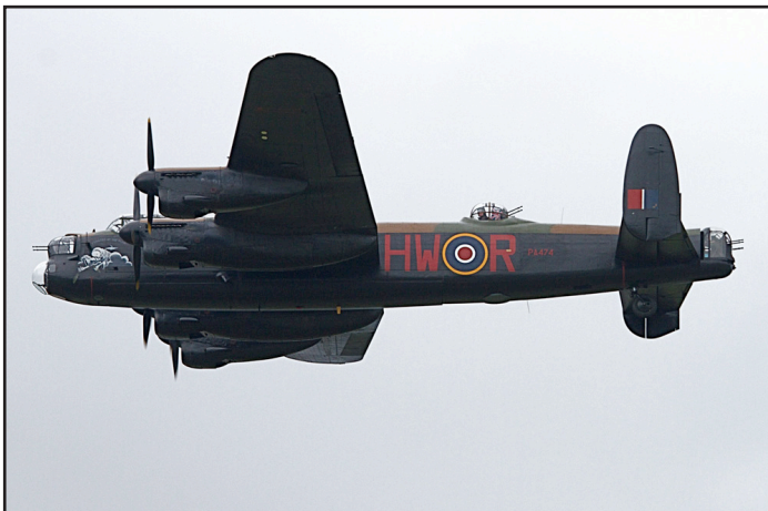
Avro Lancaster B.1, PA474, operated by the Royal Air Force Battle of Britain Memorial Flight at the Farnborough Air Show on July 9, 2012. The Lancaster has different codes on each side.