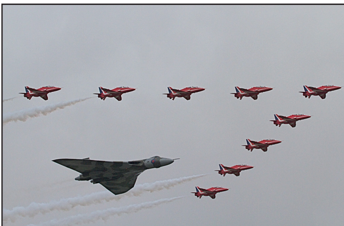
The Royal Air Force "Red Arrows" in Hawk trainers lead the privately-owned Avro Vulcan, G-VULCN, ex XH588, opening the Farnborough Air Show on July 9, 2012.