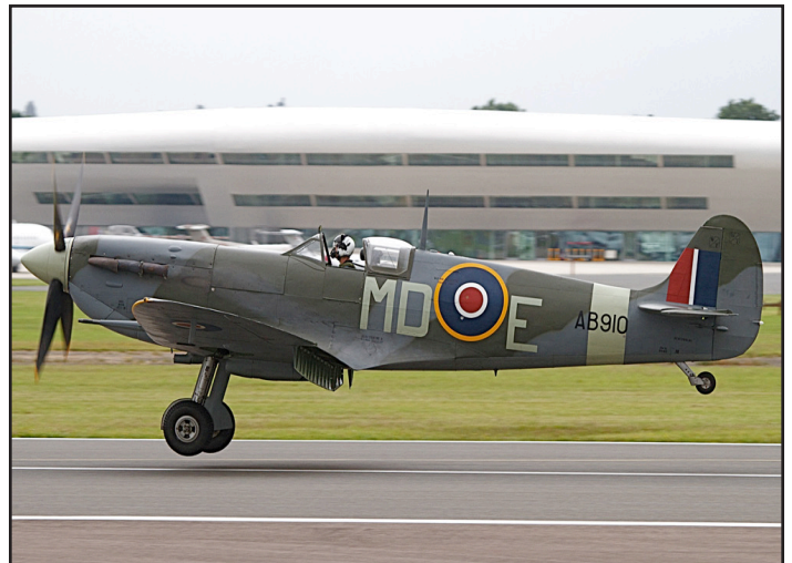
Vickers Supermarine Spitfire Mk.Vb, AB 910, operated by the Royal Air Force Battle of Britain Memorial Flight at the Farnborough Air Show on July 9, 2012.