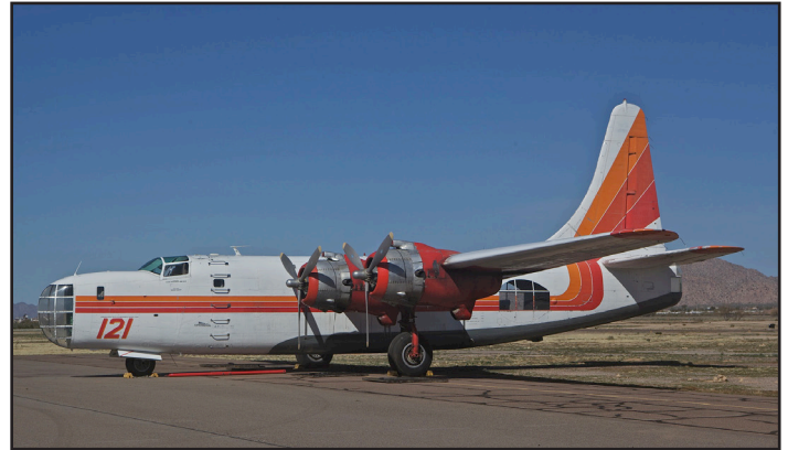
1945 Consolidated P4Y-2, N2871G, cn 66302, owned by "4Y-2 LLC".