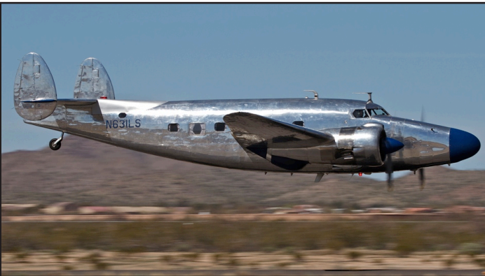
1943 Lockheed 18-56, N631LS, cn 2404, owned by Brunetto Enterprises.