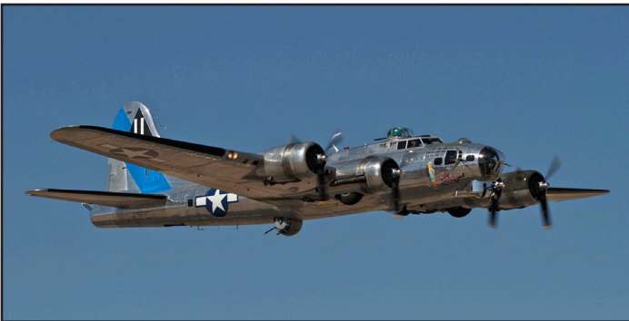
1944 Boeing B-17G, N9323Z, ex USAAF 1944-83514, owned by American Airpower Heritage Flying Museum, performed fly-bys on both Friday and Saturday.