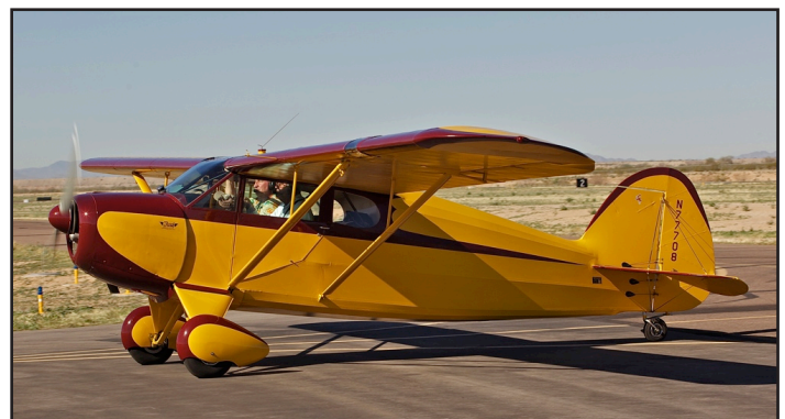
1946 Funk B85C, N77708, cn 338, owned by Desert Wings LLC.