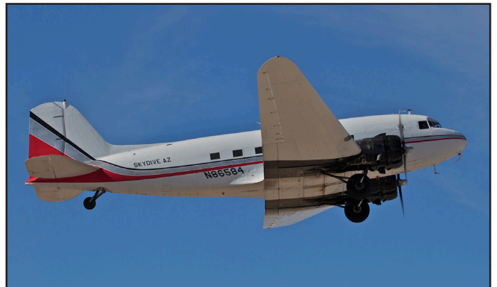
1943 Douglas DC-3C, N86584, cn 4935, owned by Aero Specialists Inc; one of three DC-3/C-47 there.