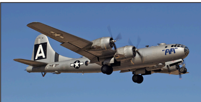
1944 Boeing B-29, NX529B, ex USAAF 1944-62070, owned by American Airpower Heritage Flying Museum, performed fly-bys on Saturday.