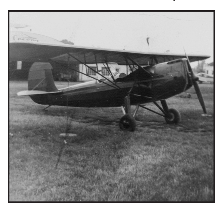
Fairchild - 22